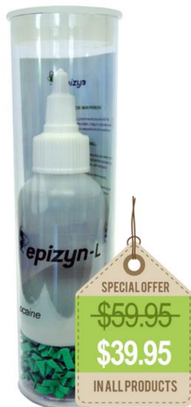
Epizyn Gel + Lidocaine

Camphor It is found in the wood of the camphor laurel, a large evergreen tree found in Asia. Most commonly associated with Vicks Vapor Rub, Camphor is often used in treating cold sores, insect stings and bites, burns, hemorrhoids, or anything that may cause itching or pain. *DO NOT USE AROUND THE EYES OR MOUTH. Epizyn Gel + Camphor is a protective counterirritant topical that can aid in the management of superficial wounds, abrasions, raw skin and other common skin conditions. The gel form of Epizyn + Camphor is especially great for use on small areas like sores and cuts.