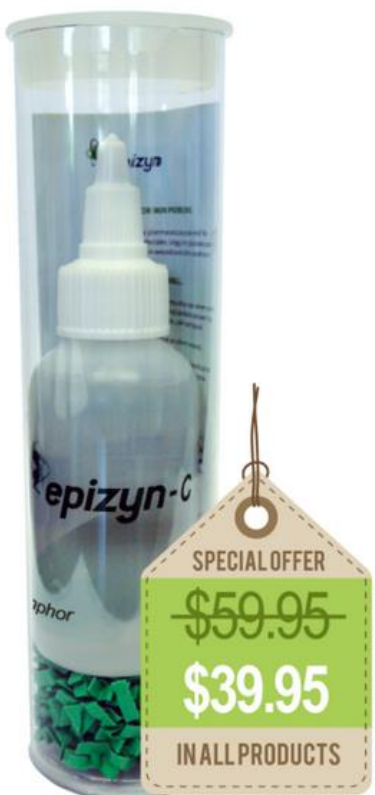
Epizyn Gel + Camphor

Epizyn Gel is a protective counter-irritant topical that can aid in the management of superficial wounds, abrasions, raw skin and other common skin conditions. The gel form of Epizyn is especially great for use on small areas like sores and cuts. Epizyn Gel is highly viscous and will stay in place covering any area.